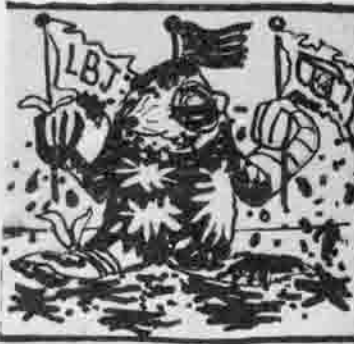
MUDSLINGUS - '64us Habitat: Throughout. This National Campaign