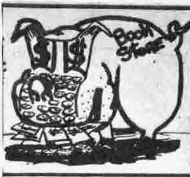
PORKUS BOOKSTORUS Habitat: Usually found feeding in S.W. corner of Cafeteria! BURP!!