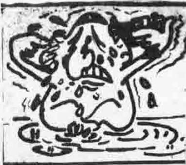
FLUNKUS - EXAMUS Habitat - Wherever test results are posted.